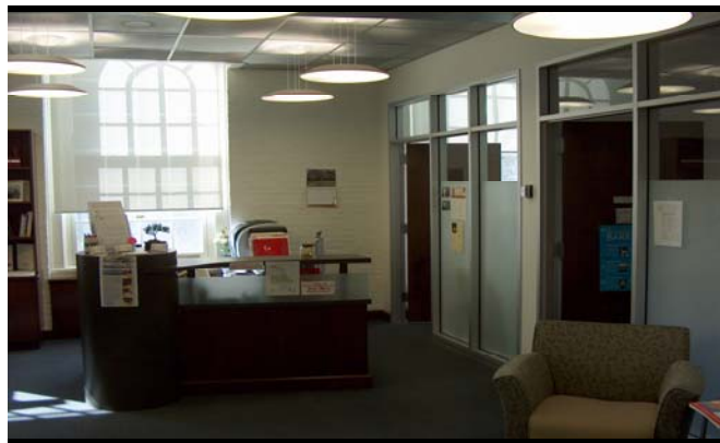
Completed Reception Area